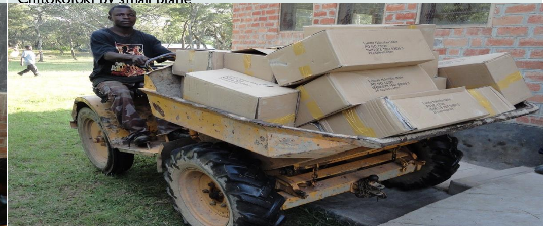
4) Lunda Bibles arrive