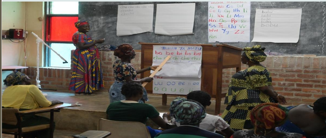
3) Some of the Nyangombe Team teaching Literacy