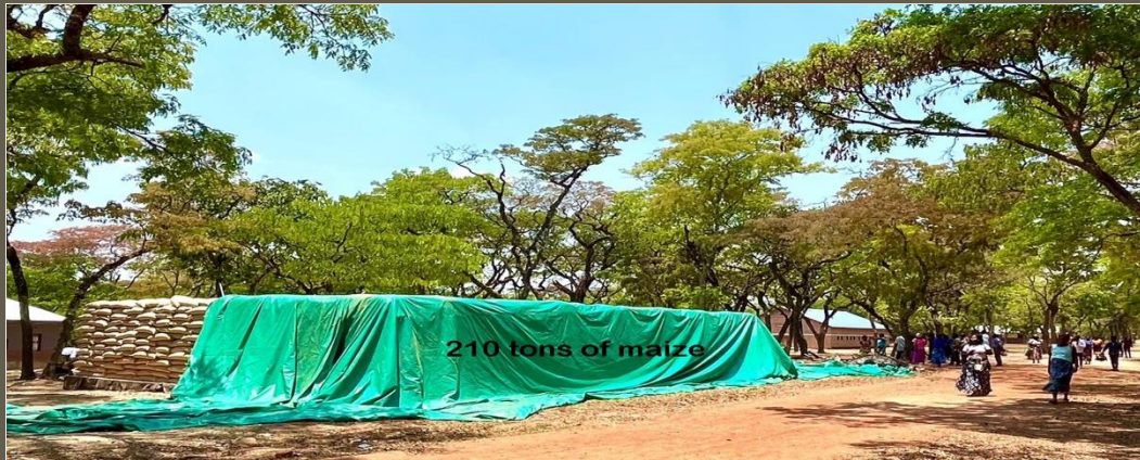
1) Maize at Nyangombe SOLD!